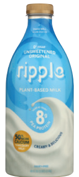
Ripple Plant-Based Milk selected varieties