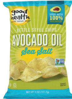
Good Health Avocado Oil Potato Chips selected varieties