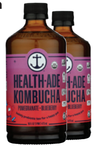
Health-Ade Organic Kombucha selected varieties