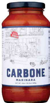
Carbone Pasta Sauce selected varieties