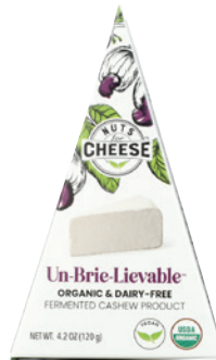
Nuts for Cheese Organic Dairy-Free Cheese selected varieties