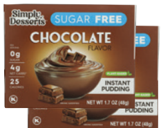
Simply Desserts Sugar Free Instant Pudding Mix selected varieties