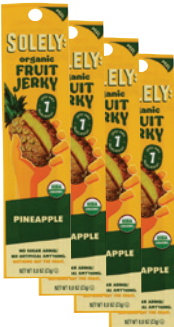
Solely Organic Fruit Jerky selected varieties