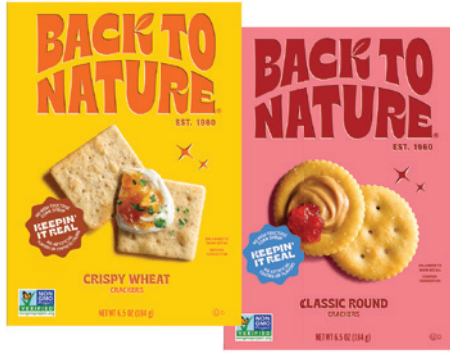
Back to Nature Crackers selected varieties

Back to Nature is remaking your favorite snacks super tasty with honest-to-goodness ingredients. Simple joys, no regrets, happy days!