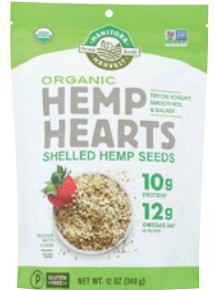
Manitoba Harvest Organic Hemp Hearts