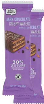
Little Secrets Crispy Wafers selected varieties