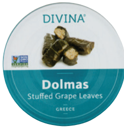
Divina Dolmas Stuffed Grape Leaves