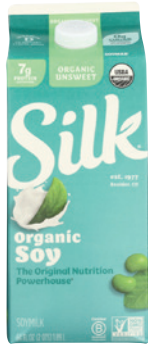
Silk Organic Soymilk selected varieties