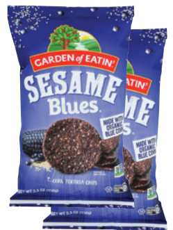
Garden of Eatin' Sesame Blues Tortilla Chips