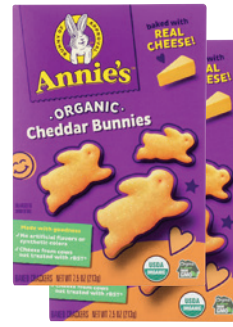
Annie's Organic Bunny Crackers selected varieties