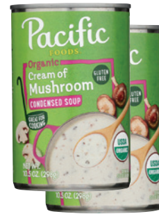
Pacific Foods Organic Soup selected varieties

Stock your pantry with delicious organic soups and broths from Pacific Foods. Our soups and broths are made with fresh, organic ingredients for wholesome comfort and a satisfying meal.