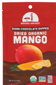
Mavuno Harvest Organic Chocolate Dipped Dried Fruit selected varieties