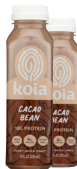
Koia Plant-Based Protein Shake selected varieties