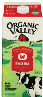
Organic Valley Organic Milk selected varieties