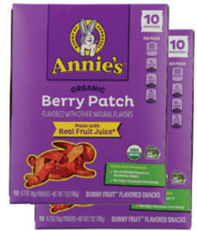
Annie's Organic Fruit Snacks selected varieties