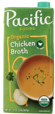
Pacific Foods Organic Broth selected varieties