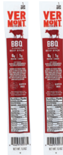
Vermont Smoke & Cure Seasoned Meat Snack Stick selected varieties