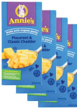
Annie's Mac & Cheese selected varieties

From partnering with the farmers who grow our food to thoughtfully choosing the packaging it comes in, we've always had your family and our planet in mind.