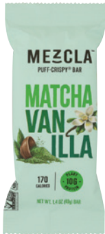
Mezcla Plant Protein Bar selected varieties