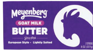
Meyenberg Goat Milk Butter