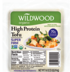
Wildwood Organic High Protein Super Firm Tofu