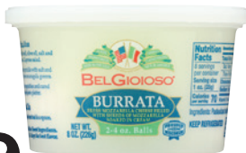
BelGioioso Burrata Mozzarella Cheese Balls