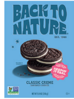
Back to Nature Sandwich Cookies selected varieties