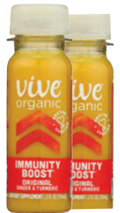
Vive Organic Organic Wellness Shot selected varieties