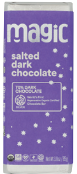
Magic Organic Chocolate Bar selected varieties