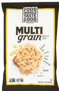
Food Should Taste Good Tortilla Chips selected varieties