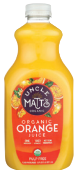
Uncle Matt's Organic Orange Juice selected varieties