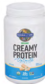
Garden of Life Organic Creamy Plant Protein with Oatmilk (selected varieties)