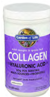
Garden of Life Collagen with Hyaluronic Acid