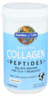
Garden of Life Grass Fed Collagen Peptides

Looking to up your protein intake? How about support for hair, skin, nails, and joints? Garden of Life offers just what you're looking for with clean, nutritious, and delicious protein and collagen choices tailored to your needs.